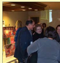
Capitol Theatre memorabilia and the future plans and renderings of the Near West Theatre and Cleveland Public Theatre buildings were on view.