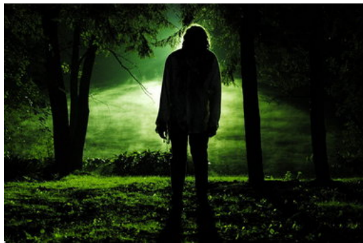
Midnight Syndicate Films

All cleveland.com Facebook & Twitter accounts >>